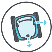
Dual-drive PowerStream™ mobility system