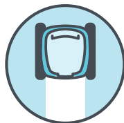
Advanced dynamic active scrubber