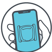
Set & forget, control your robot from anywhere